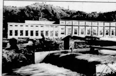
Jordan River blasts a plume of water through B.C. Hydro's dam above, while, at left, a photo from the 1920s shows the spillway and powerhouse built by Vancouver Island Power Company.

However, by the late '60s, Victoria's growth began to show how inadequate power supplies were becoming and B.C. Hydro announced an upgrade to the Jordan River plant in 1968, after "brown-outs" in Victoria homes had only been averted the previous winter by carefully managing power going to up-Island pulp mills and saw mills.