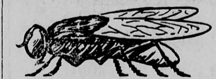
The destruction of the house fly is a public duty. Almost every American State Board of Health is carrying on a crusade against him.

The original limitation of the number of the baronetage has long been obsolete. Their present number, exclusive of those members of the peerage who are baronets as well, exceeds 1,000. The claimant of an hereditary title must be prepared to prove two propositions, the creation and existence of the dignity, and the fact that he is heir to the person first created. A baronetage is created by the grant of letters patent. The enrollment of the patent on the patent rolls, or the actual production of the original, is, of course, the best evidence of the creation of the dignity; but its non-