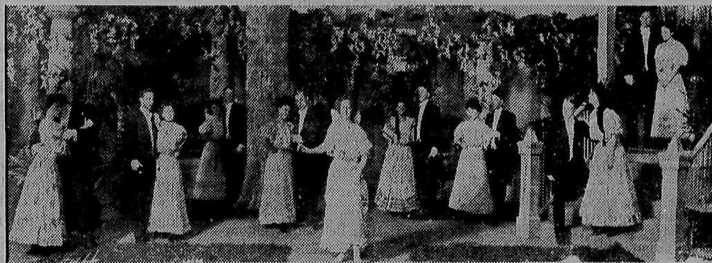
Scene from "Lola from Berlin."